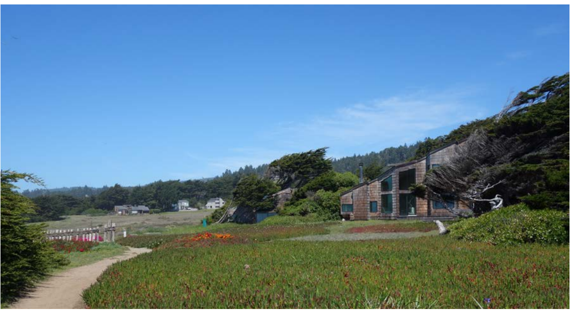
C1 Esherick Hedgerow Houses seen near the Sea Ranch Trail Post #1

From Sea Ranch Trail Post 1, the sign noting the beginning of the private Sea Ranch Trails, you can see how these buildings of simple shape become houses that offer unique experiences, C1.