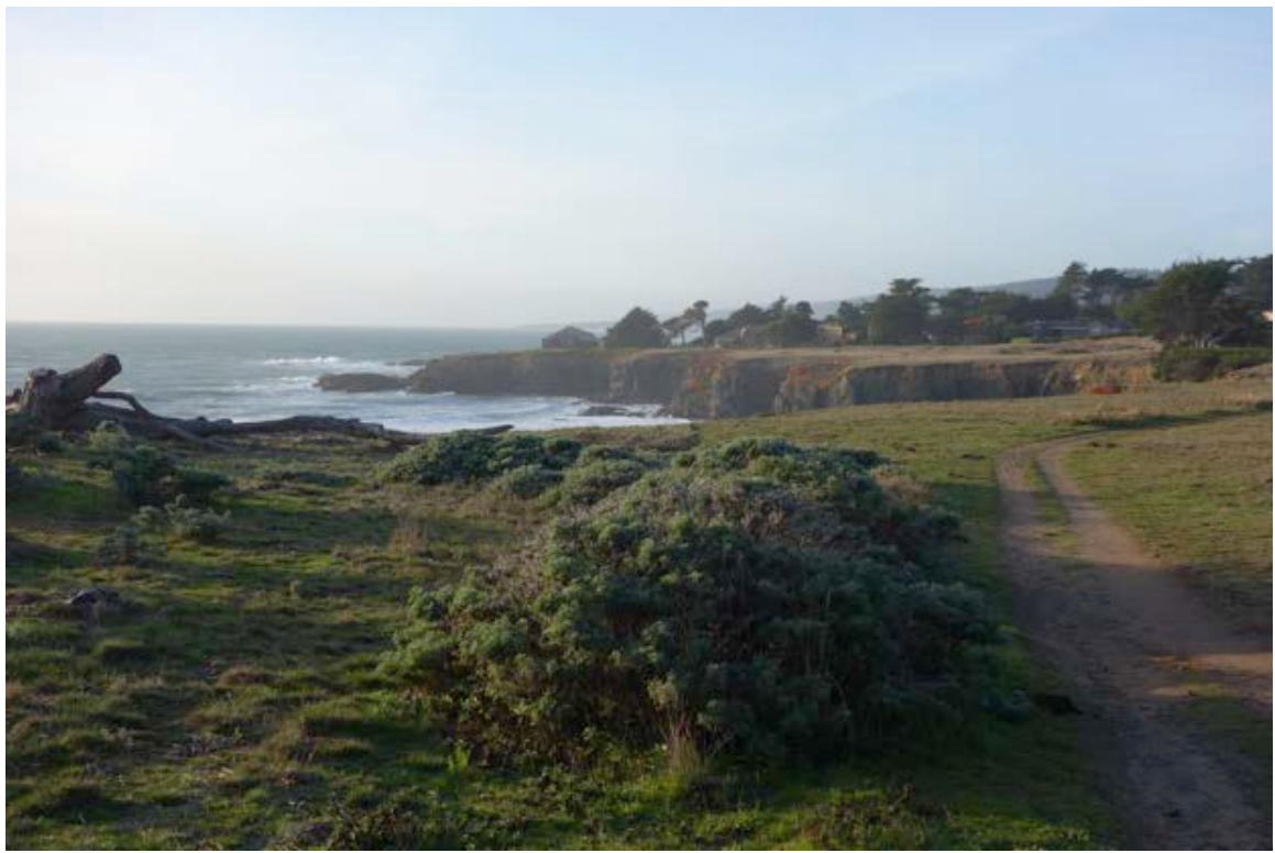
C5 Meadows and point beyond Brigantine Reach

The nearest meadow has lines of houses following the hedgerow on the far side, one aberrant cluster in the center and a strong path of willows and riparian foliage reaching down through the meadow from the forested slopes above. Out on the bluff point of the next meadow beyond is one of the very few houses at The Sea Ranch that are set out beyond the coastal Bluff Trail. This one stands in pyramidal form settling down on a promontory of its own. When it was first built in 1968, it was more like the indented landforms of the coast, with a large open deck facing south and wrapped against strong winds by the enclosed rooms around it. The deck was later itself enclosed with walls and roof of glass that diminish the particularity of the place, although perhaps offering more predictable comforts. The original house was designed in 1968 by Gerald McCue then a colleague on the faculty at Berkeley.