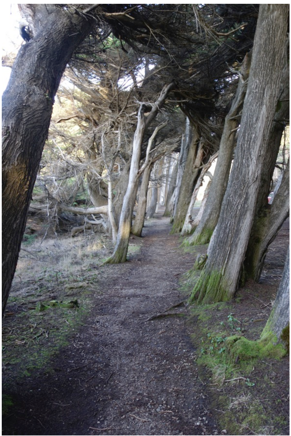
C7 Cypress trunks of Brigantine Hedgerow path

This is one of the few signature hedgerows that have a Sea Ranch Trail running up through the line of trees, a very special experience of being between these very tall columns as you move up the trail. You will note that to the south of the path there is large open space between