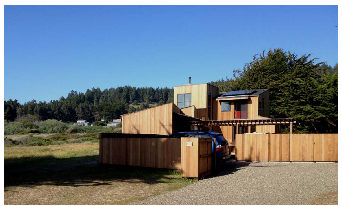
C8 Bowsprit House (Donlyn Lyndon and Frank Architects)

At TSR Trail Post 3A turn into Bowsprit Close. From here you can now see the willow riparian beyond, and the spaces nearby formed by secondary cypress growth, as well as the house noted earlier that I have designed, C8, with two wings of rooms forming an enclosure made with the trees. A many-windowed tower at their intersection gathers sun into the heart of the house at all times of day, and solar panels on the roof provide electricity.