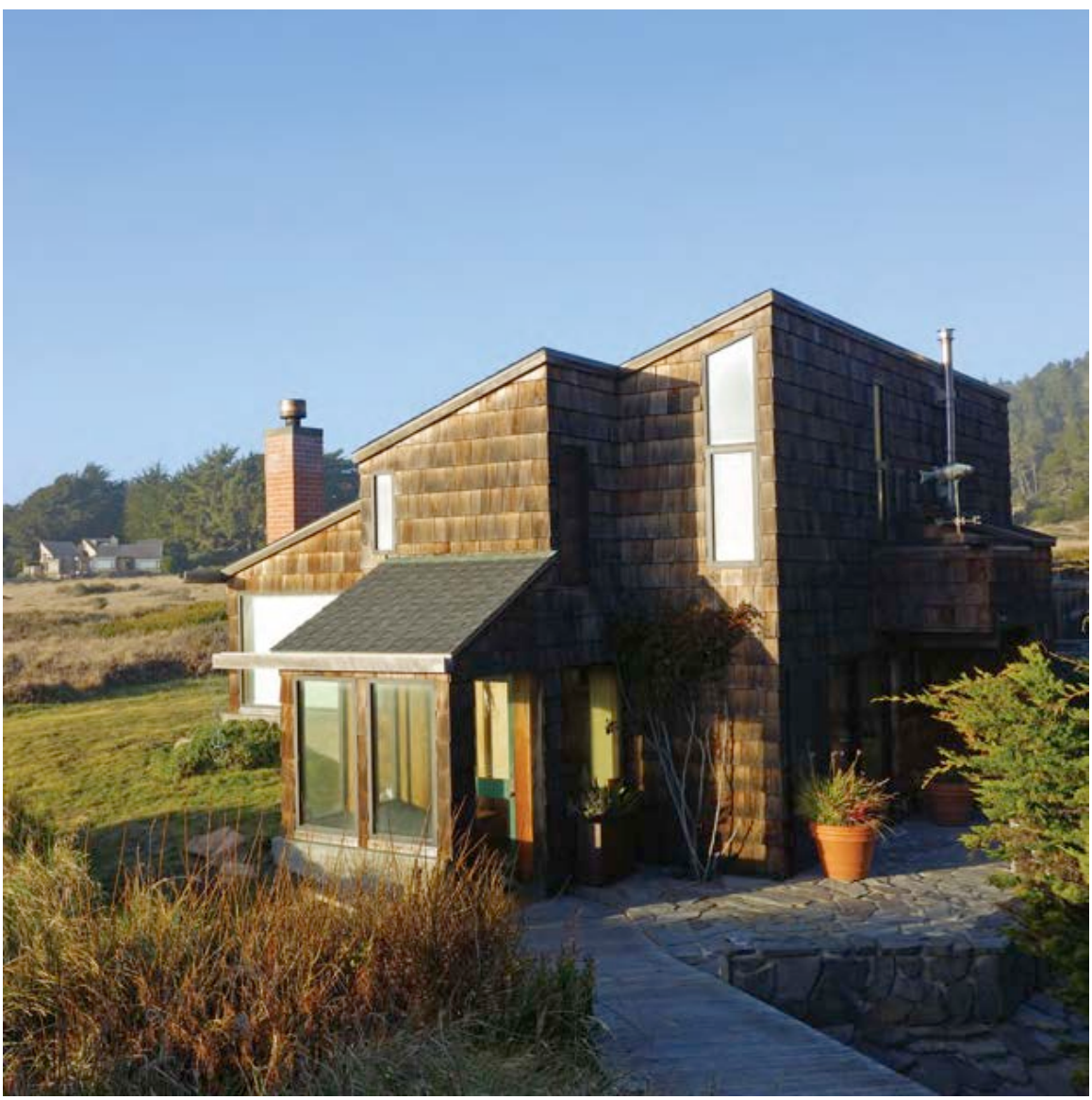
C3H View from the south, private side, of the Esherick house entry

The higher segments of the walls on the south have tall narrow windows on their edges so light can wash along the walls to illuminate the rooms. Over the entry porch are small and narrow slit windows at the corner, one vertical, one horizontal — the better to see framed glimpses of the sea, meadow and sky from the sleeping loft above the kitchen. In their proportions these windows pre-figured the miniature vertical and horizontal panoramics so favored now by users of digital cameras.