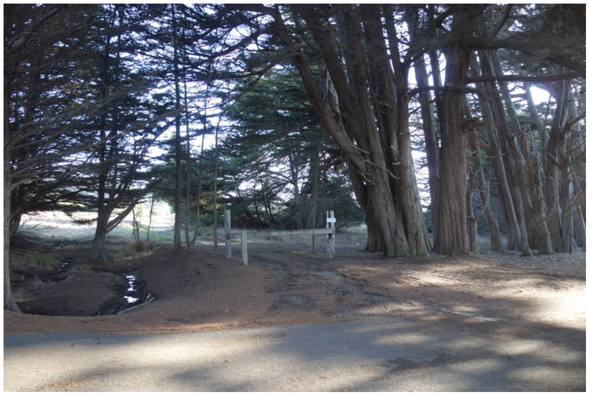
C17 Drainage path by gate marking entry to Lodge properties and Black Point Hedgerow

Turning and looking down Black Point Reach, which runs parallel to the signature Black Point Hedgerow planted early in the twentieth century, you can appreciate the linear geometry which the hedgerow generated for this area and the houses that backed up to it.