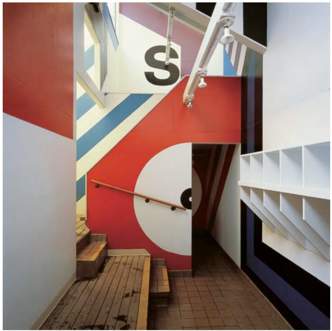
C11H Supergraphic in men's locker room at Moonraker Recreation Center

translucent roofs above) and boldly colorful. Yes boldly: red walls with white circles, white walls with wide blue stripes and rose stripes, a spot of sun yellow ceiling. What is most surprising though is the way these shapes and colors are deployed. They make this tiny space expansive, with half-circles matched to align across spaces and forms thrusting and moving along the walls. These were the work of Barbara Stauffacher Solomon, the graphic designer of The Sea Ranch logo. She, Charles Moore and Bill Turnbull have invested this little building with extraordinary ingenuity and energy. These graphics were also widely noted and published as SuperGraphics, a term that came into extensive use in the 70's. Books that have been published on the genre credit this as the place where it began.