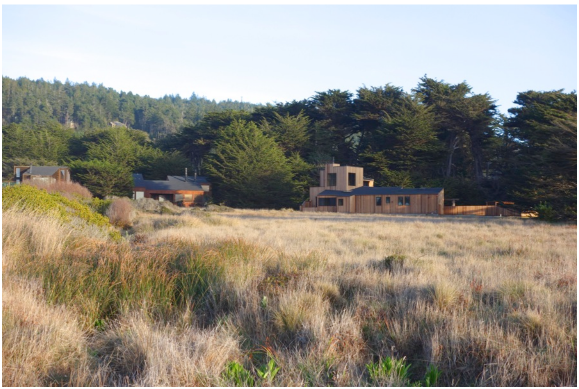
C6 Houses along north side of Brigantine Hedgerow; house on the right by Donlyn Lyndon with Frank Architects

Moving back to the Brigantine Reach Hedgerow (TSR Trail Post 3), proceed up the path between the tall Monterey Cypress trunks, photo C7.