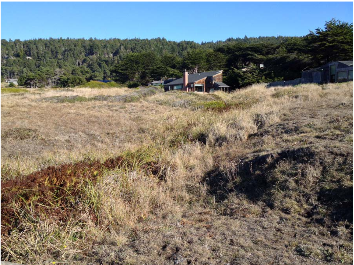
C2 Joseph Esherick's own house, among the Hedgerow Houses facing Sea Ranch Meadow

This house C2 was Joseph Esherick's own, and it is a marvel of quiet ingenuity. With only an 875 square foot print it has three bedrooms, two bathrooms and living, cooking and eating spaces — all skillfully arranged on several levels within its compact volume. From the meadow you can discern, by its brick flue, that the fireplace is placed on the meadow wall and that the simple volume of the house rises up from that wall with a small segment protruding out from the side, which tops a glass enclosed entry just next to the point where the stream passes next to the house and another small plank bridge forms the approach. To one side of the chimney, long windows barely skimming the tops of the grass reveal that its construction is set partly into the ground so that the rooms have a profound sense of being part of the meadow. Windows on the perpendicular wall are proportioned more like a picture as they look back across the face of neighboring houses to the silhouette of Black Point.