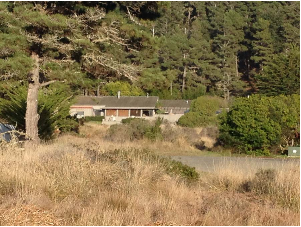
C16 "Doctors' quarters" building by Joseph Esherick & Associates

It has served at various points as a doctor's office, the general manager's office and residence, and as a private home. Its large long roof sloping up towards the hills sits well in the landscape still and set the theme for houses in this section.