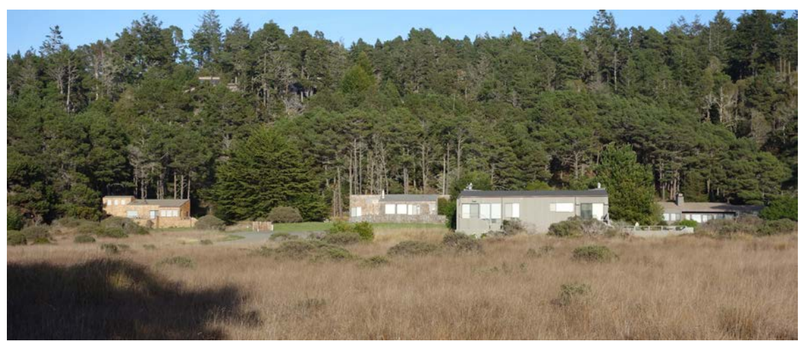
C15 Forest edge and houses along upper reaches of Sea Ranch Meadow

Looking back up the meadow towards the forested hills, this is a good place to see where the forest comes down towards the meadow, C15.