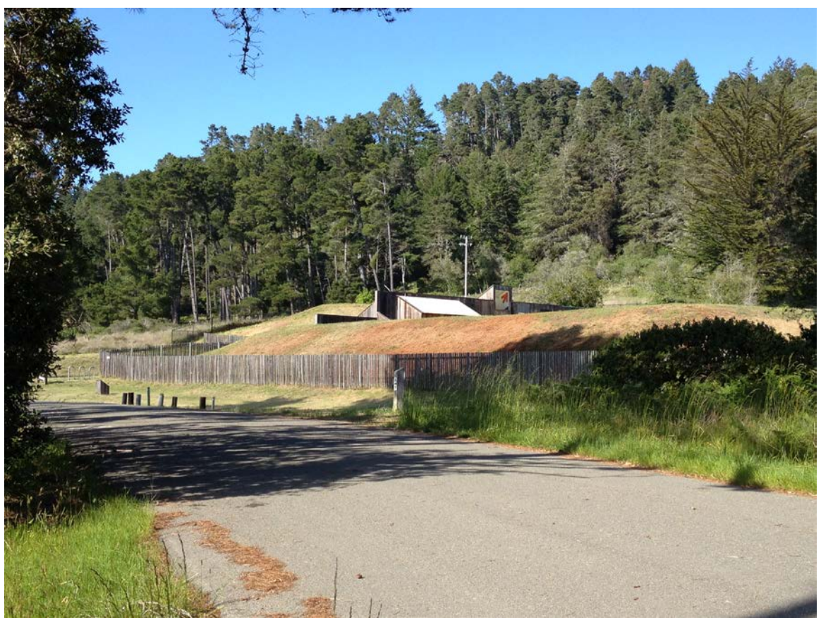
C9 Moonraker Recreation Center (MLTW & Larry Halprin)

Continue up the trail to its end or move out along Brigantine Reach to the intersection with Moonraker Road. Here you will see to the north, the Moonraker Recreation Center, C9 .