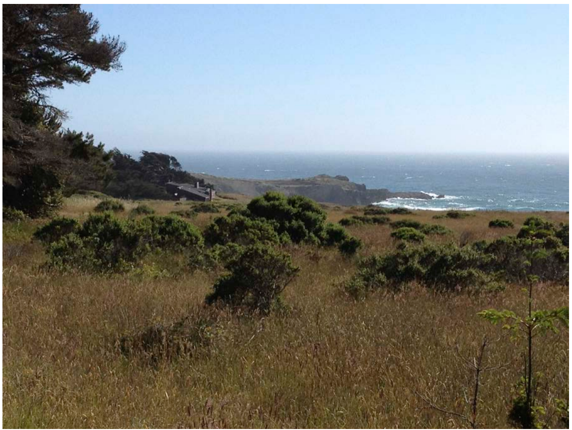
C12 Sea Ranch Meadow seen from Moonraker Road

Return on Moonraker Road to a position across from the road marker for Captain's Close. Note first the view down across the open Sea Ranch Meadow to the ocean and the houses ranged along its edges, C12.