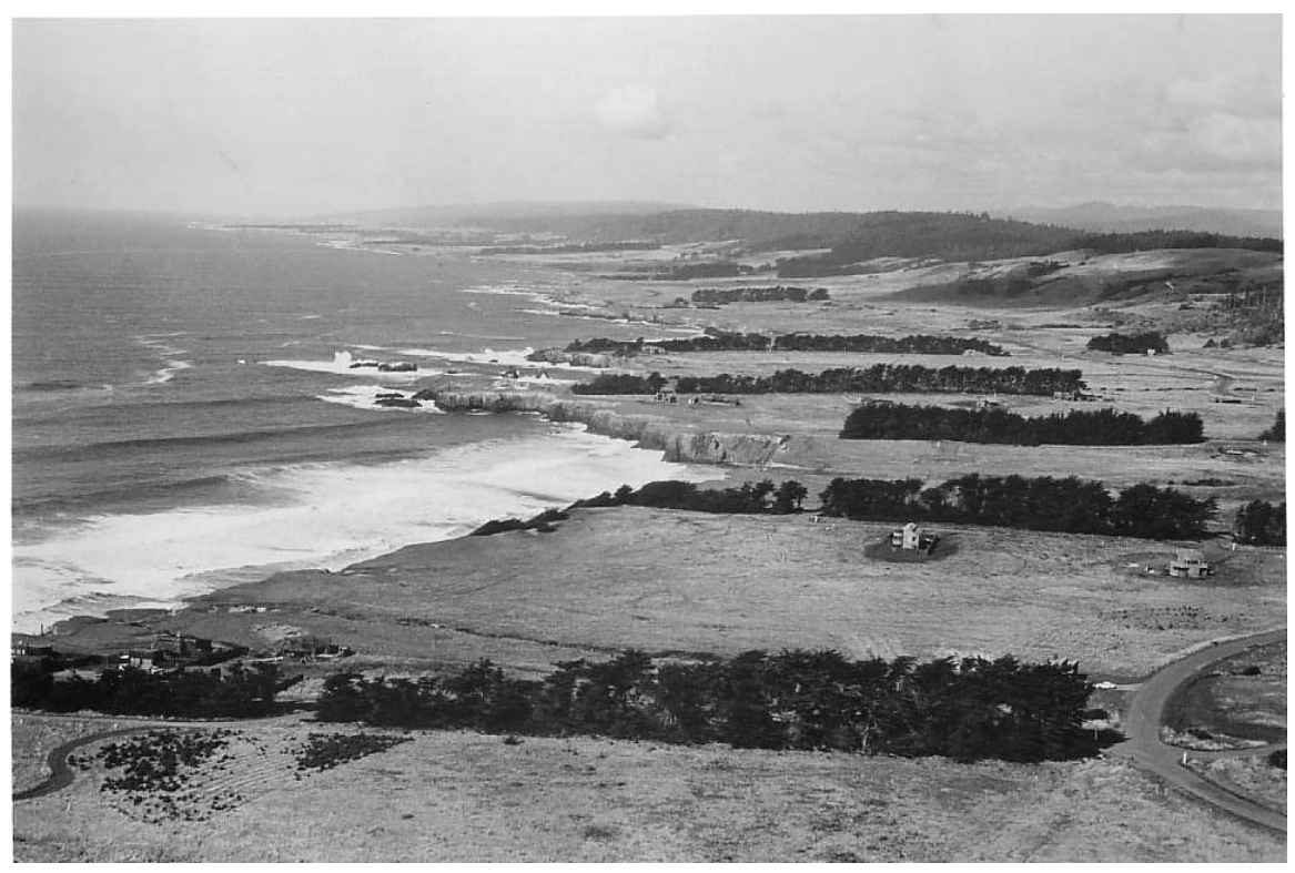
D1H Aerial view of Sea Ranch Meadow and beyond

It shows The Sea Ranch Meadow just north of the hedgerow and the extent of the large prairie reaching up towards Gualala Point, with wind-breaking hedgerows planted by ranchers roughly 100 years ago paced out along the highway.