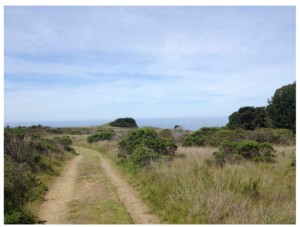
D2 Black Point and vegetation on north of Black Point Prairie

being addressed now by the Planning and Commons Landscape Committees.