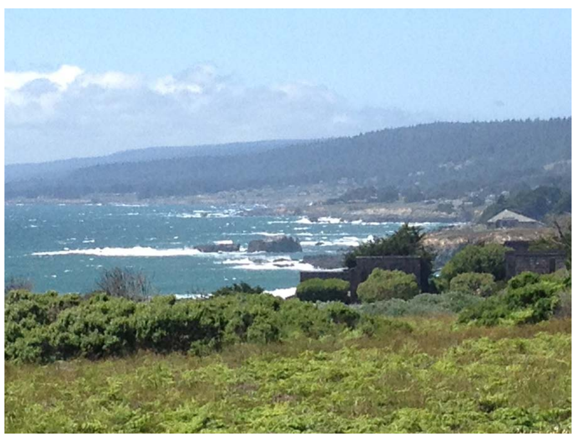
D8 Summation photo

It's a landscape that has been made by many imaginations, now held in accord by the statement included in each property sale at The Sea Ranch: "It must be assumed that all owners of property within The Sea Ranch, by virtue of their purchase of such property, are motivated by the character of the natural environment in which their property is located, and accept, for and among themselves, the principle that the development and use of The Sea Ranch must preserve that character for its present and future enjoyment by other owners."