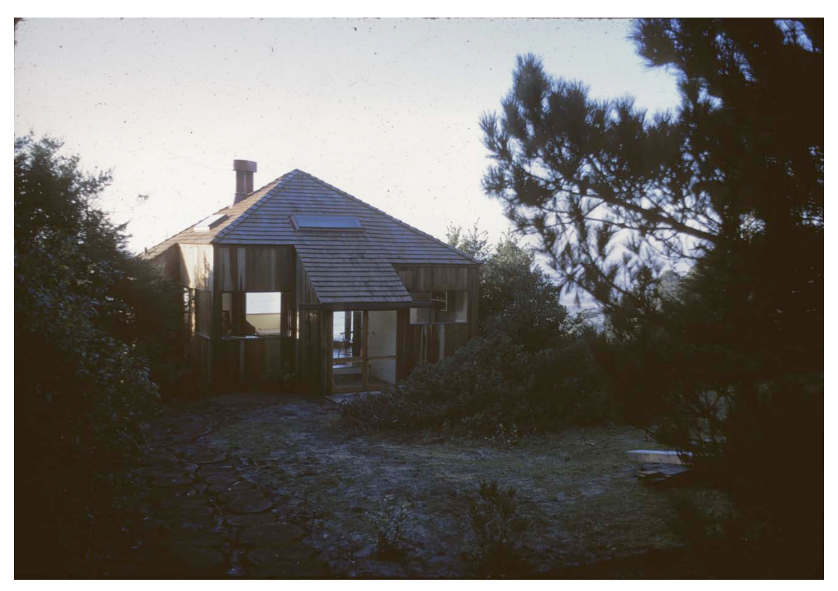
D4H Reverdy Johnson House 1966 (MLTW, Moore & Turnbull Architects)

Many others followed. These are not included in this walking tour, since for many (including myself), it would be beyond the scope of even a strenuous walk. You'll note, though, that on the following Commons Landscape Committee map D5H there are a number of trails that thread through the forest, most within the commons and creeks that follow the lower slopes of ravines.