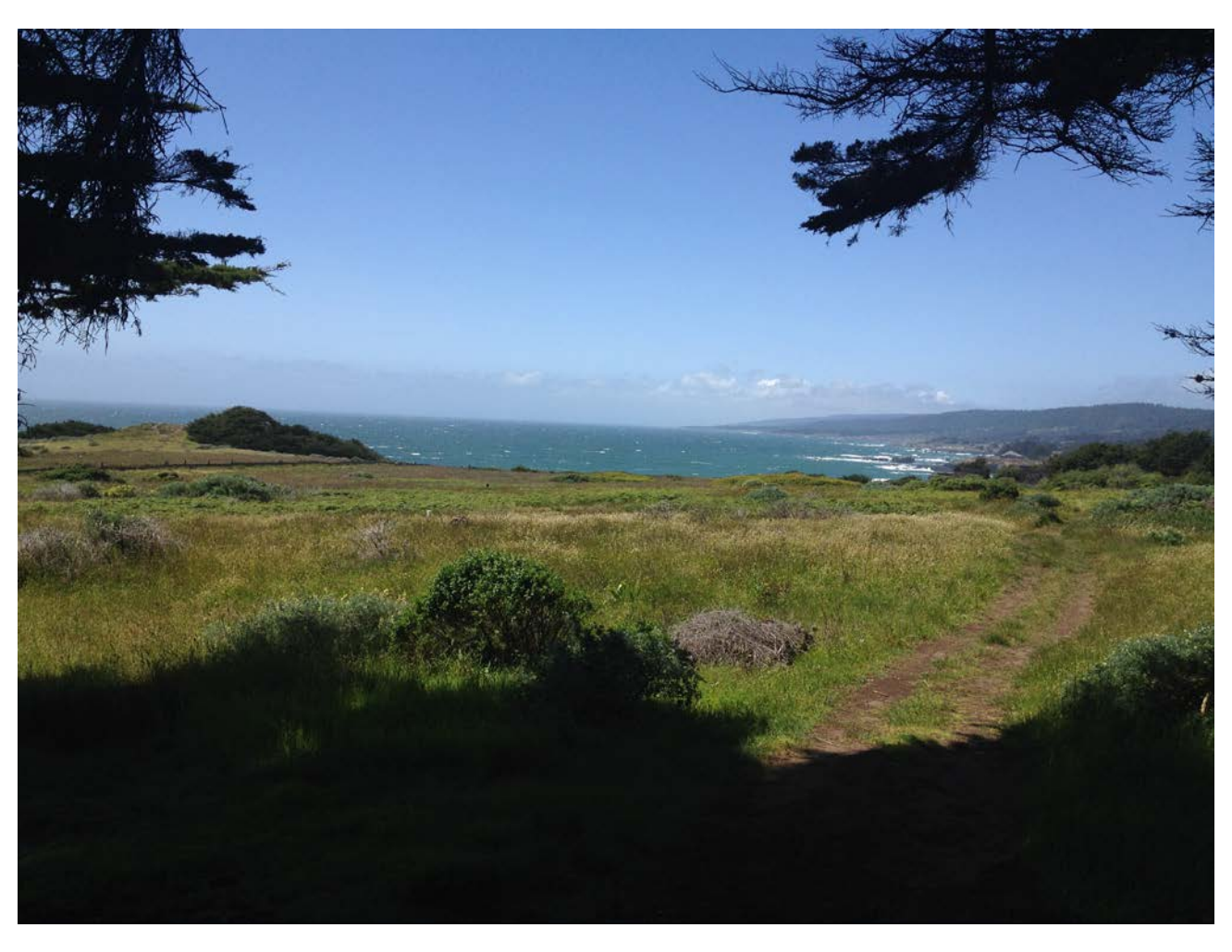
D7 View from edge of Sea Ranch Lodge property