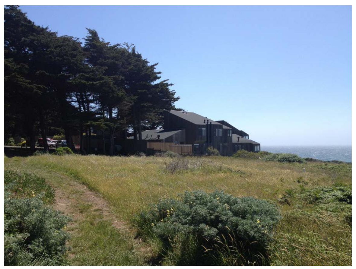
D6 Hedgerow line continued by Sea Ranch Lodge buildings

Midway along the passage through this area there is an intersection with the Public Access Trail which leads from the parking area on the highway down across the meadow alongside the pines and beyond the southernmost of the Hedgerow Houses to the Public Access Stairs leading down to Black Point Beach. The Bluff Trail then goes back to the Lodge.