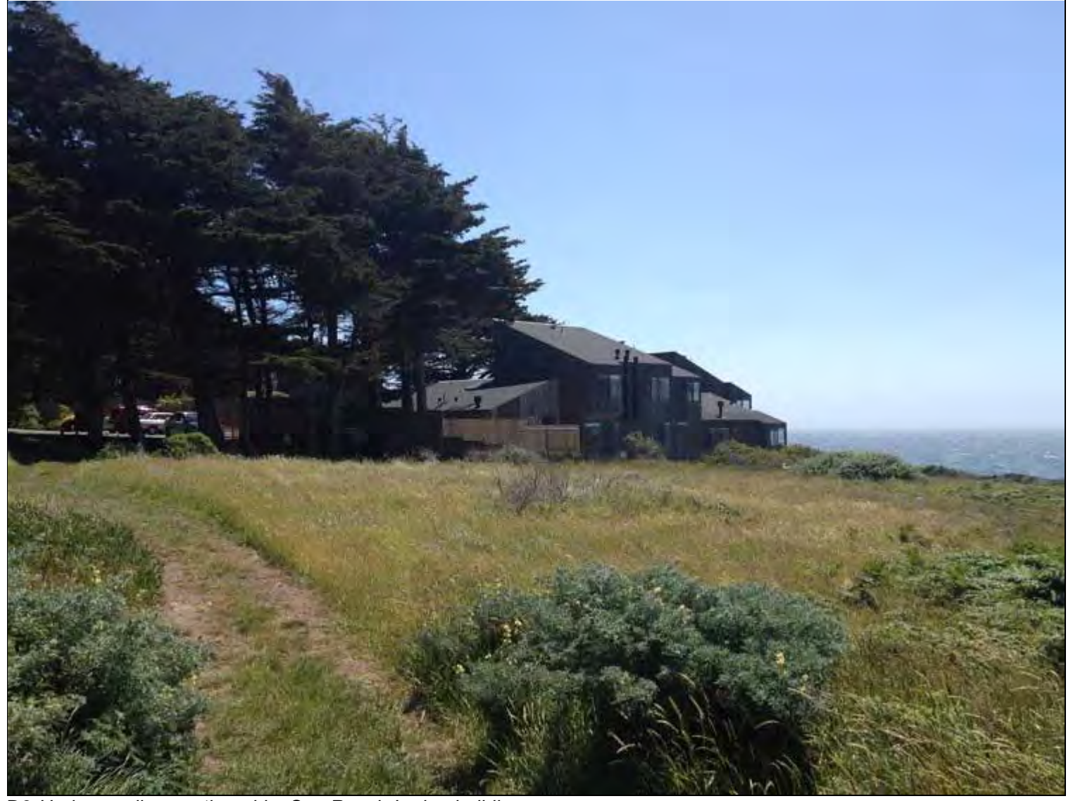
D6 Hedgerow line continued by Sea Ranch Lodge buildings