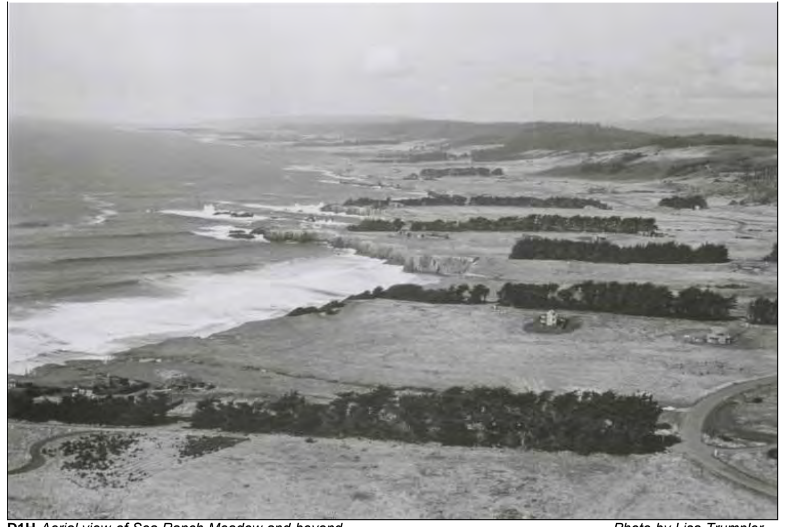
D1H Aerial view of Sea Ranch Meadow and beyond