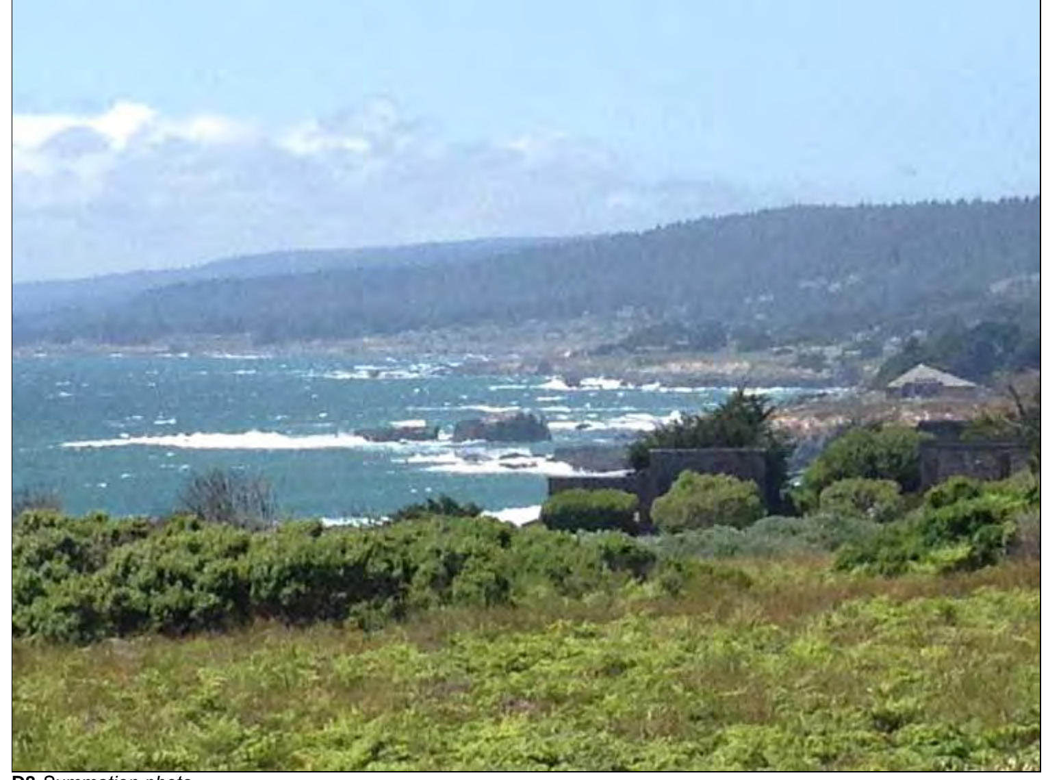
D8 Summation photo