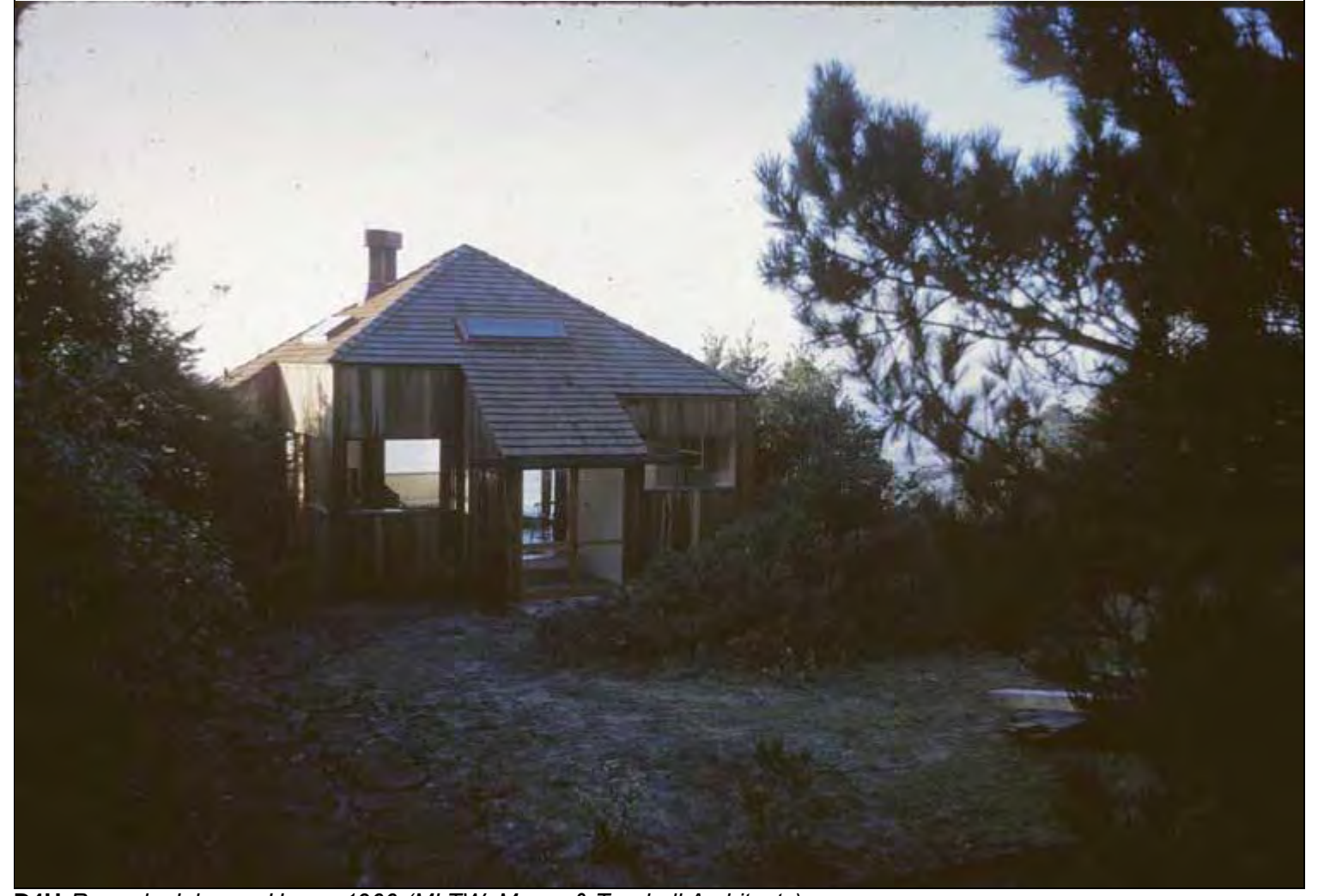
D4H Reverdy Johnson House 1966 (MLTW, Moore & Turnbull Architects)