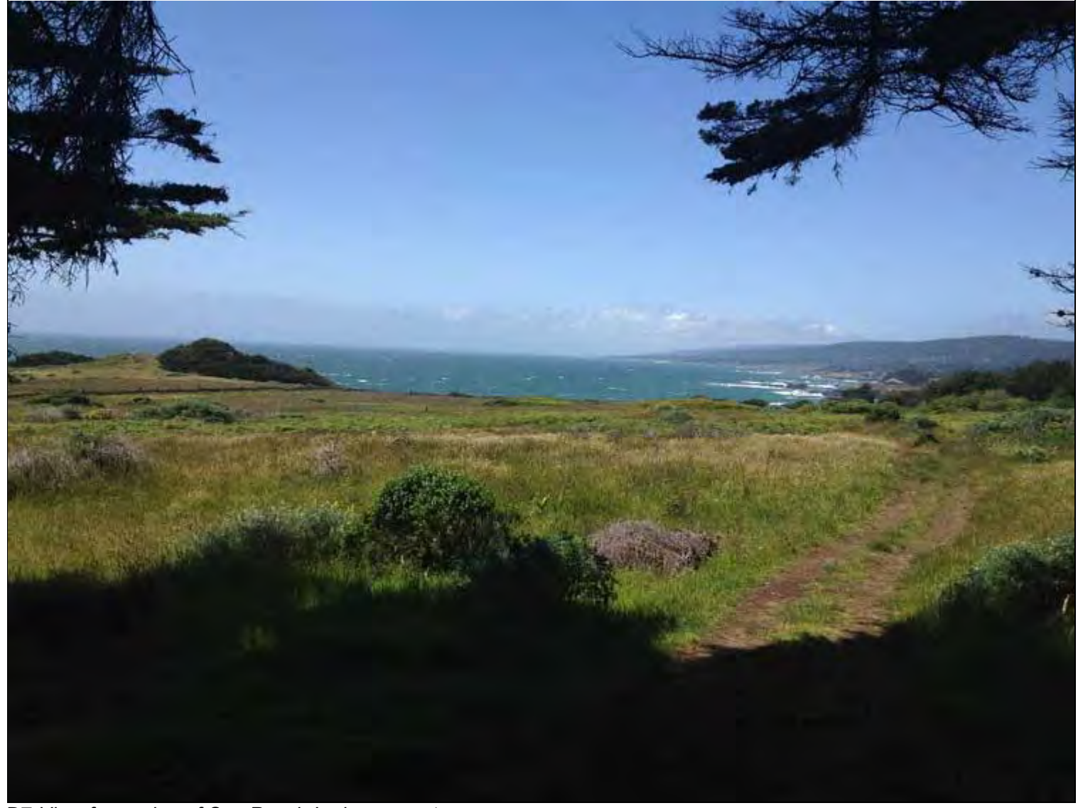
D7 View from edge of Sea Ranch Lodge property