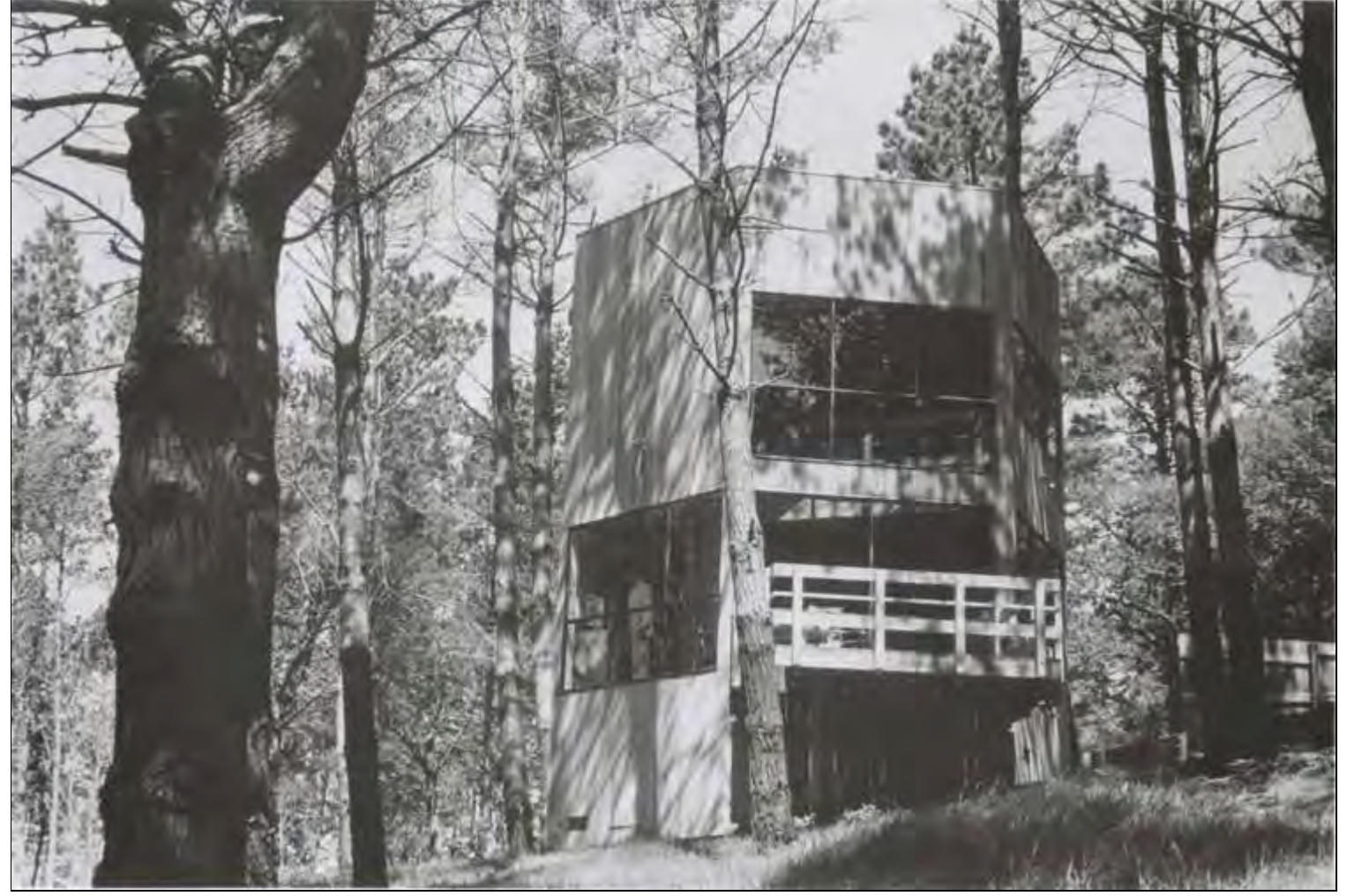
D3H House by Marquis and Stoller