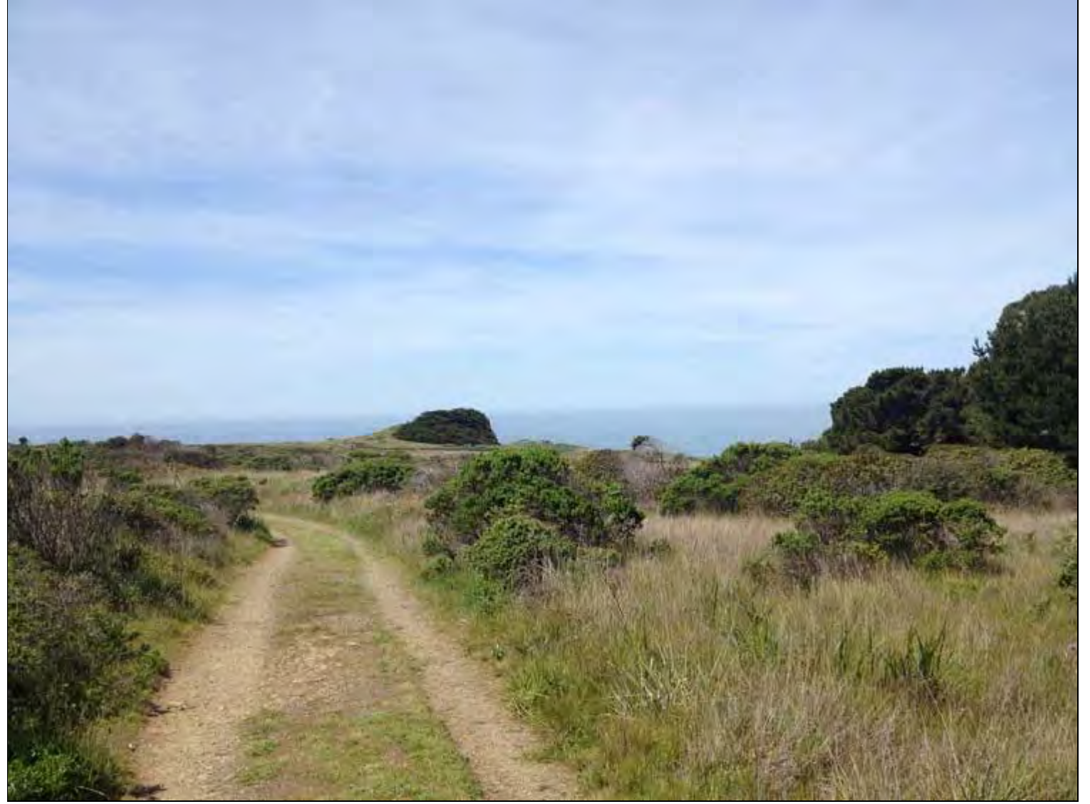
D2 Black Point and vegetation on north of Black Point Prairie