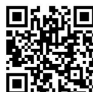
SSU Center for Environmental Inquiry, California's Coastal Prairies