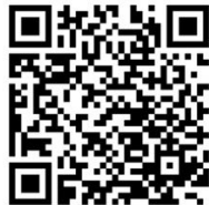
Greater Farallones National Marine Sanctuary, Doghole Port: Del Mar Landing