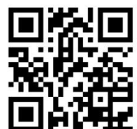
California Marine Protected Areas