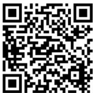
UCSC Pacific Rocky intertidal, Sea Ranch MARINE site