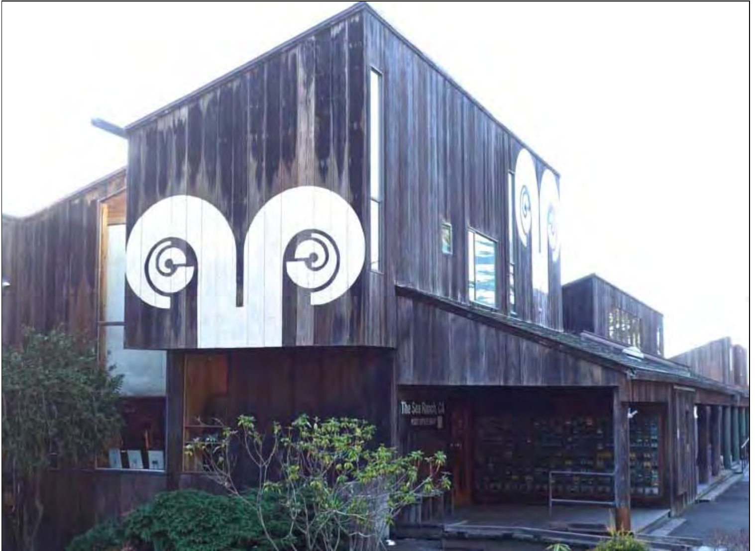
A1 The Sea Ranch Store with Logo