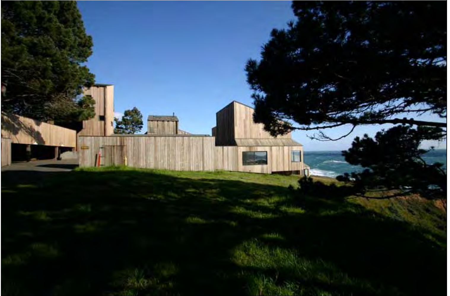
A13H Condominium One from north, showing car court and tower