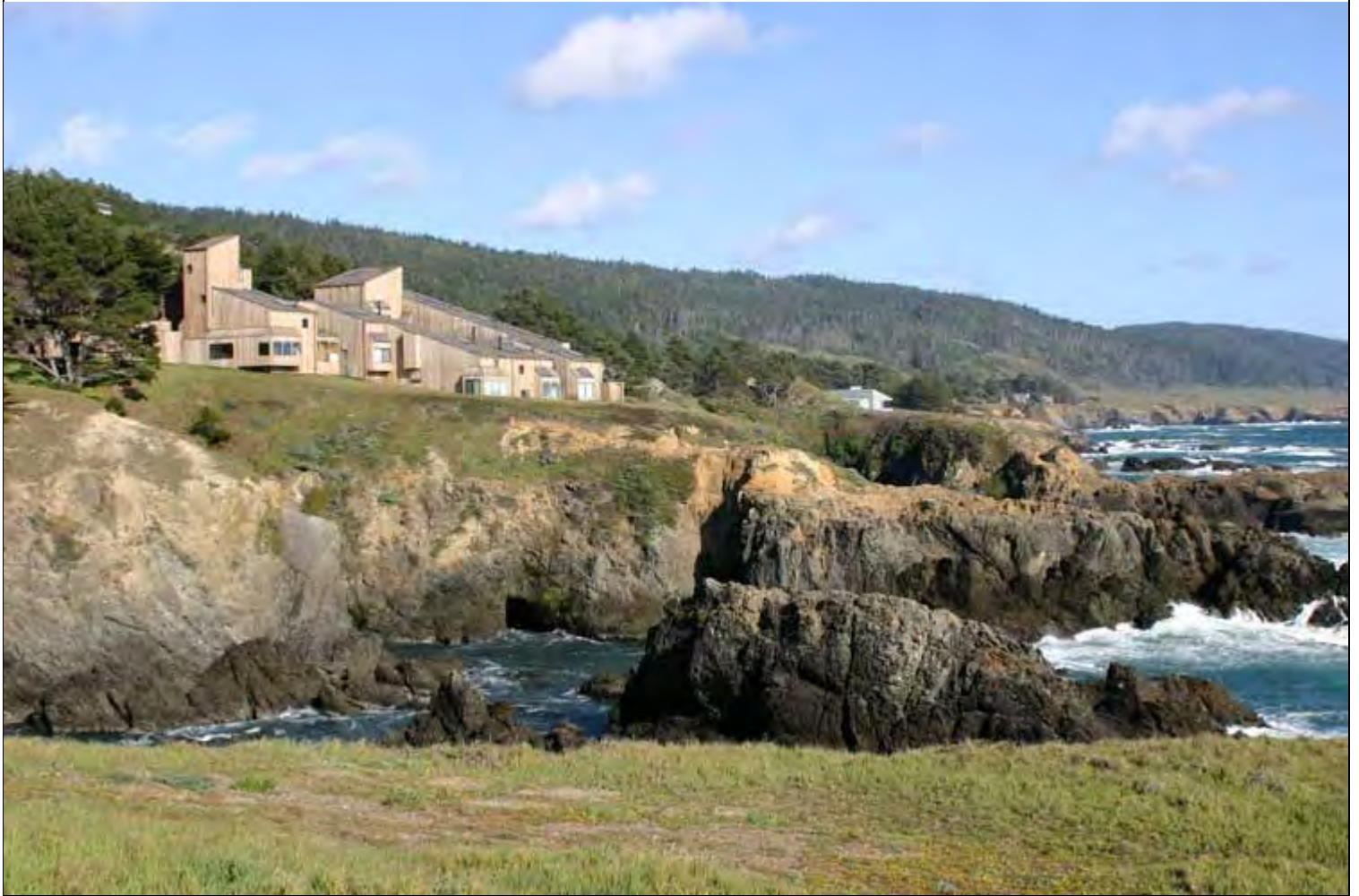
A9 Condominium One from the north (Bihler Point)