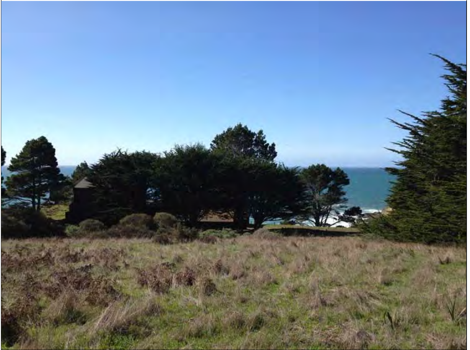
A5 Sea Walk Meadow