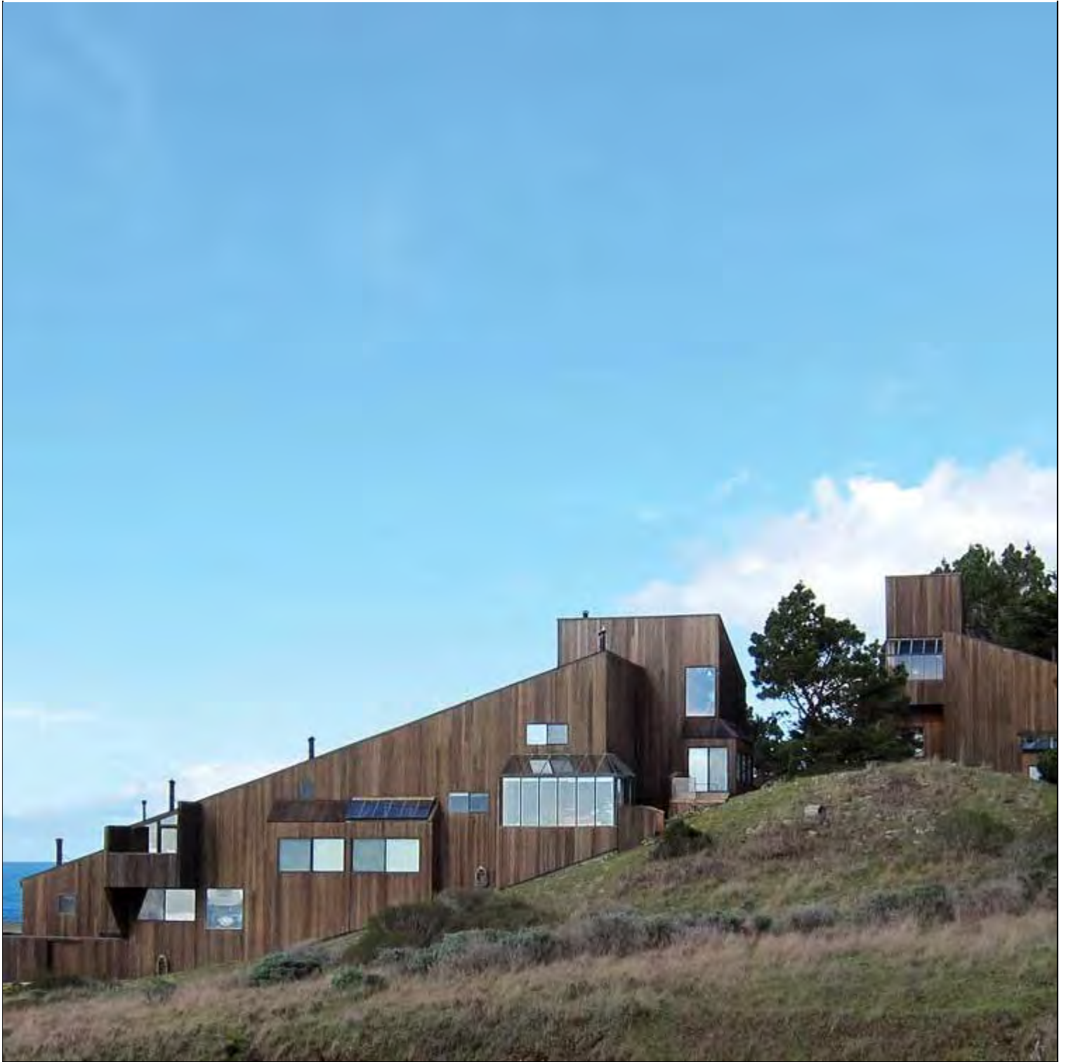
A11H South face of Condominium One