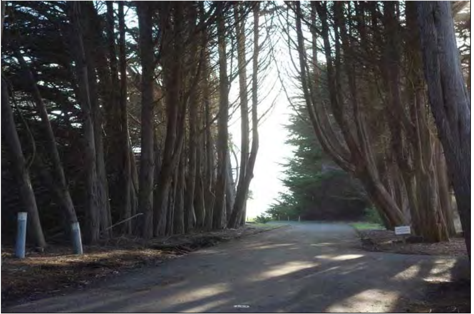
A2 Sea Walk Drive Hedgerows