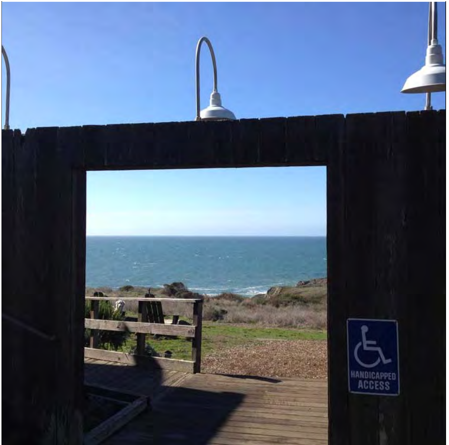
A8 Passage through Lodge court wall