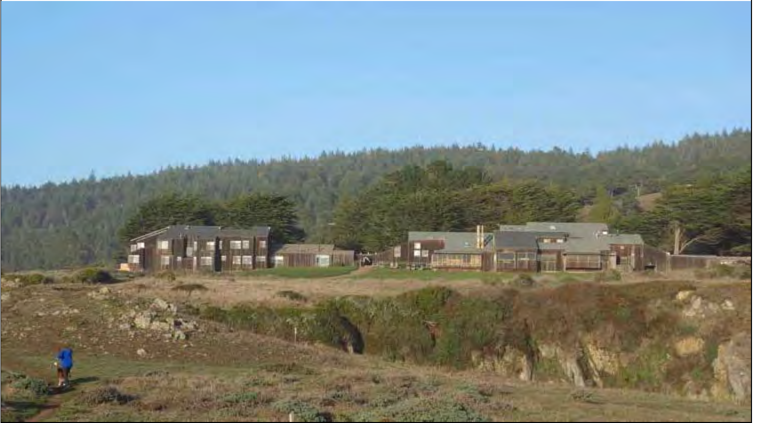
A14 Ocean face of the Sea Ranch Lodge