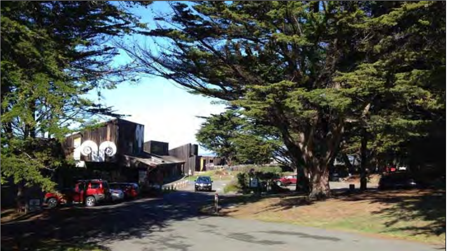
A The Sea Ranch Lodge entry

Begin this walk at the main entry doors to the Sea Ranch Lodge.