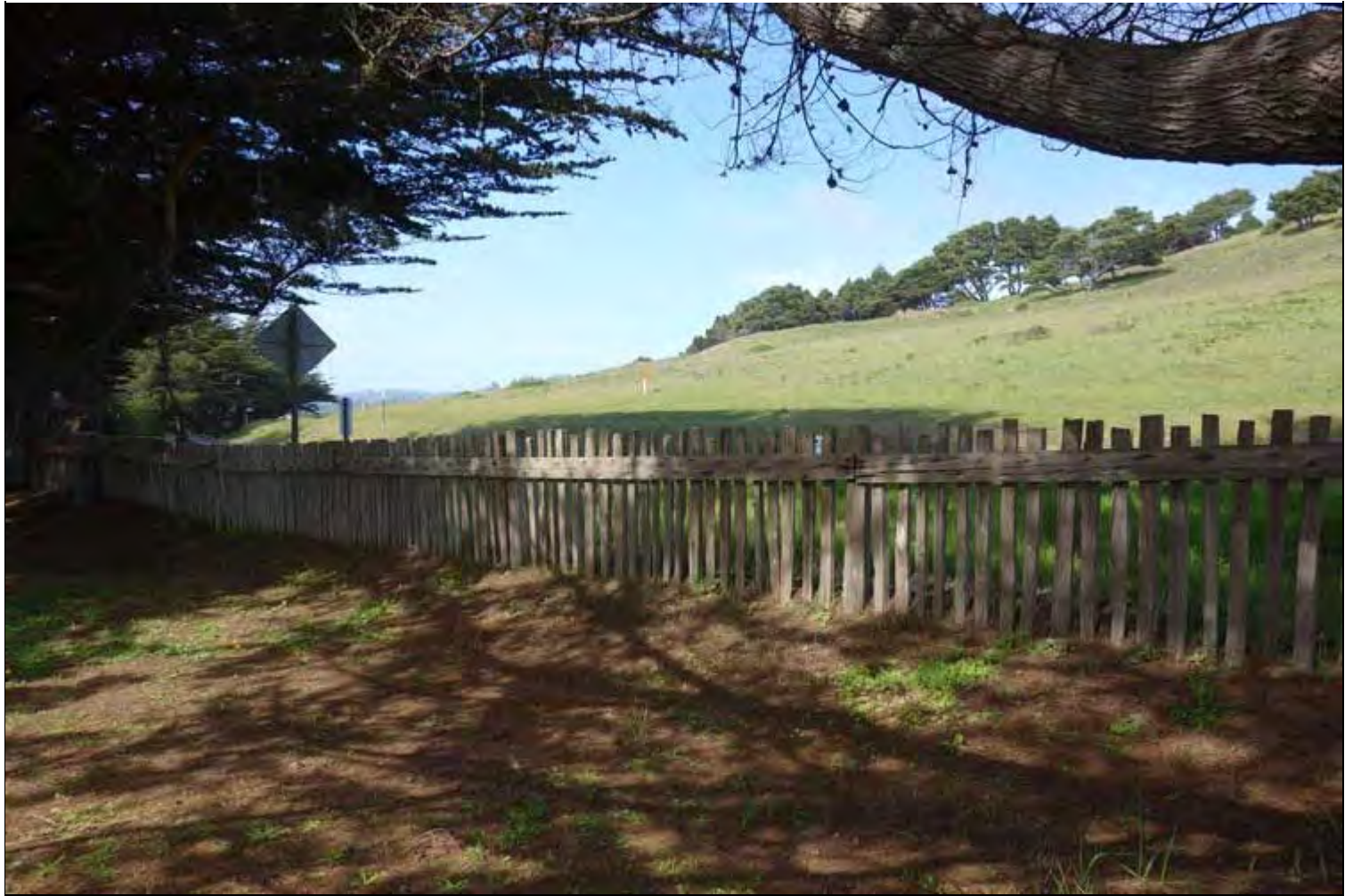
A3 View uphill from tree near Highway 1