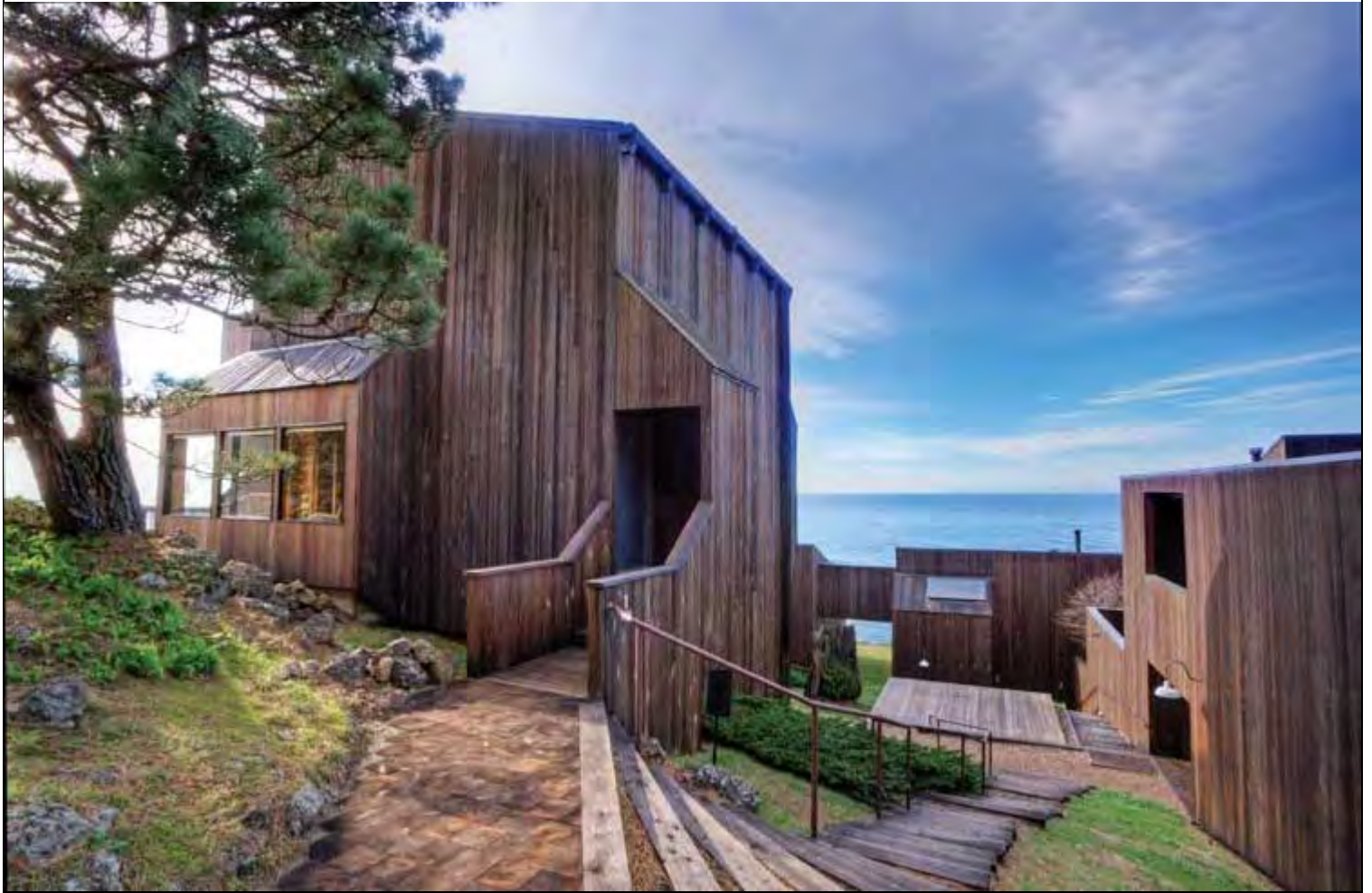
A10H Condominium One entry and meeting court