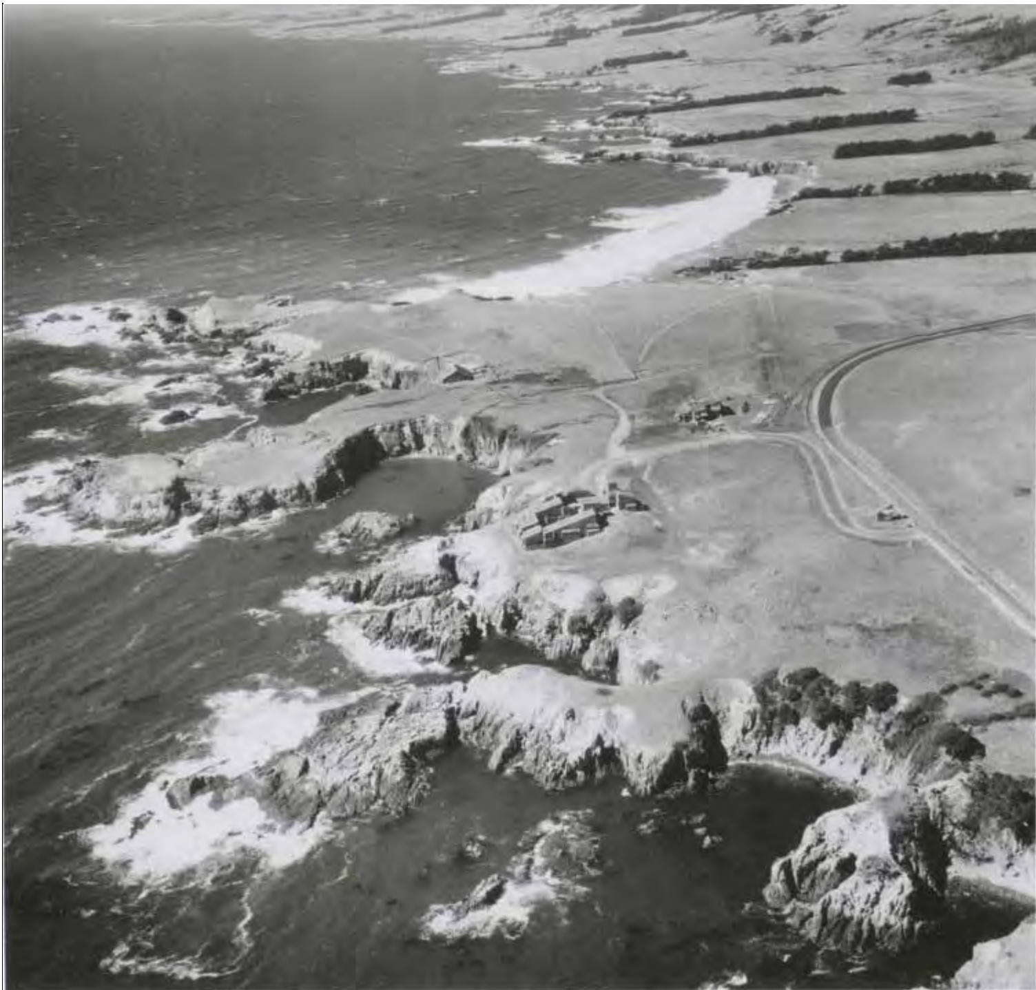
A4H Aerial view of Bihler Point, Condominium One, the Sea Ranch Store and Marker Building (date circa 1967)