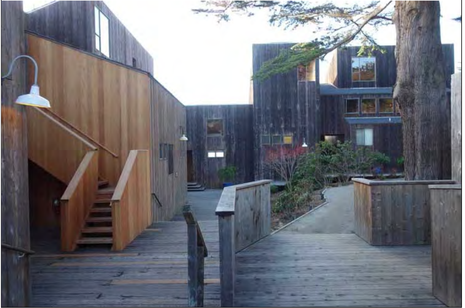
A7 Sea Ranch Lodge bedroom wings