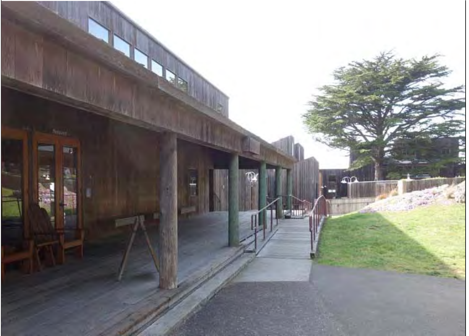
A6 Sea Ranch Lodge entry porch and extension